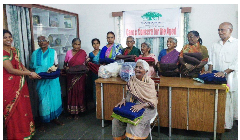
"Let us serve the poor and needy"